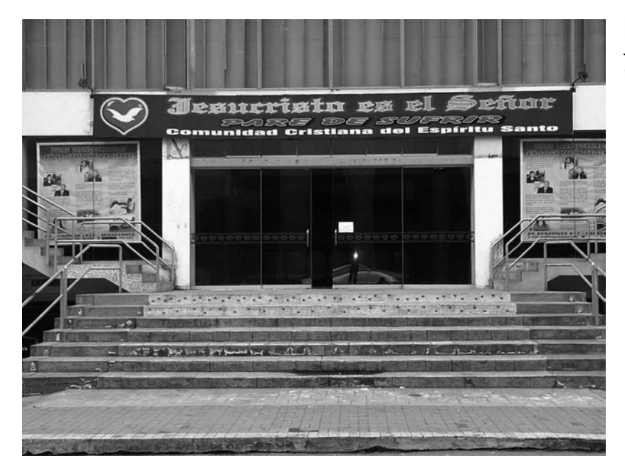
FIGURE 16.1 Jesucristo es el Señor

The Lima branch of the Brazil-based Universal Church of the Kingdom of God. The first two inscriptions say 'Jesus Christ is God' and 'Put an end to your suffering!' The white dove in the red heart is a worldwide UCKG logo.